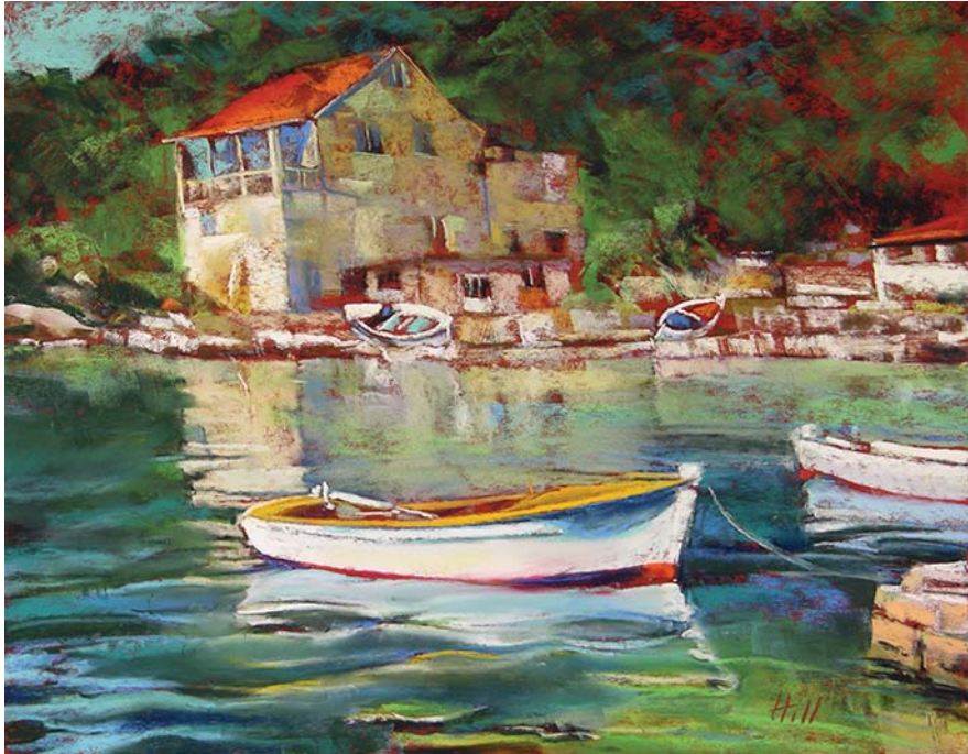
"Croatian Island Port" 11 x 14.