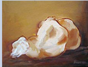
Sleeping Woman, 2007, oil on canvas